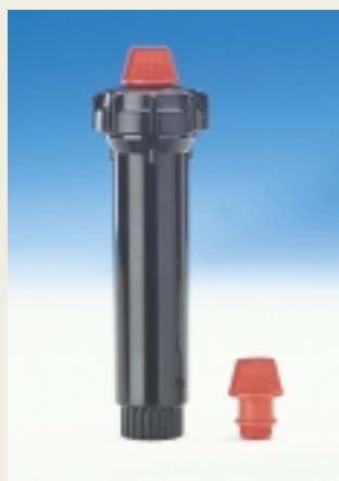
Environmentally friendly, degradable flush plug